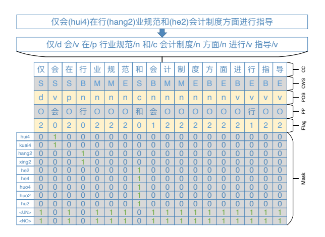
Figure 1: Input features of the given sample sentence.

In the example sentence "仅会在行业规范和会计制度方 面进行指导"(It will only provide guidance in occupational standards and accounting system.), we assumed only a part of polyphonic characters in the sentence would be labelled: The first "会" (target candidate set is [hui4, kuai4], the correct pronunciation is hui4), "行" (target candidate set is [hang2, xing2], the correct pronunciation is hang2) and "和" (target candidate set is [he2, he4, huo4, huo2, hu2], the correct pronunciation is he2); and other polyphonic characters such as the second "会" and the second "行" would not be labelled. Relevant input features of the example sentence are shown in Figure 1.