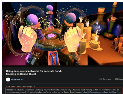
Figure 1: Video metadata: Social media videos are often associated with surrounding text, descriptions or titles, as denoted in the red box.

our neural LM training is explicitly conditioned on the video metadata, and selectively attends to the metadata via an attention mechanism. The resulting contextual neural LM is used to rescore the lattices generated from the first-pass hybrid ASR decoding.