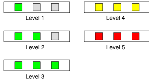
Figure 3: LED lighting patterns on Amplitude mode.

As a function enhancement, Smart Tube can be connected to a computer or smartphone either via a USB cable or wirelessly through a Bluetooth modem. A Windows PC can also receive acceleration data from Arduino Uno through a COM port and can be set up to display the values on screen, which may well reduce the monotony of vocal training and keep trainees motivated. PC games can be incorporated into the system using gamification principles [8] to attract more trainees and engage